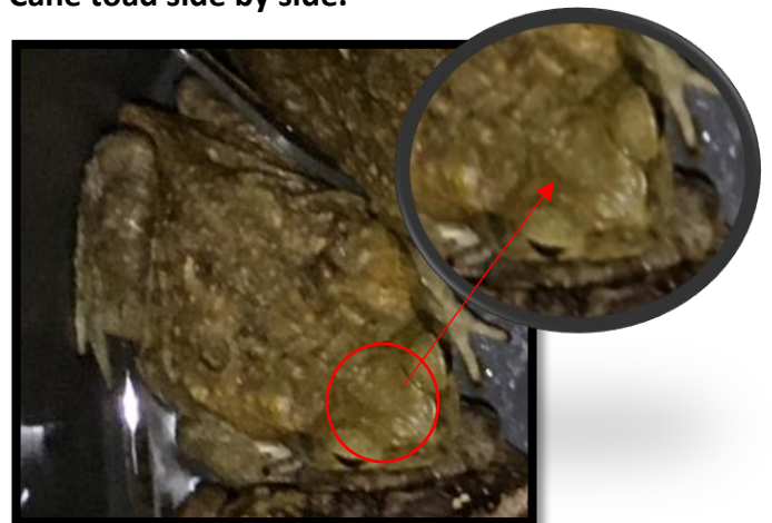
Above: Toxic Cane Toad – NO Crest